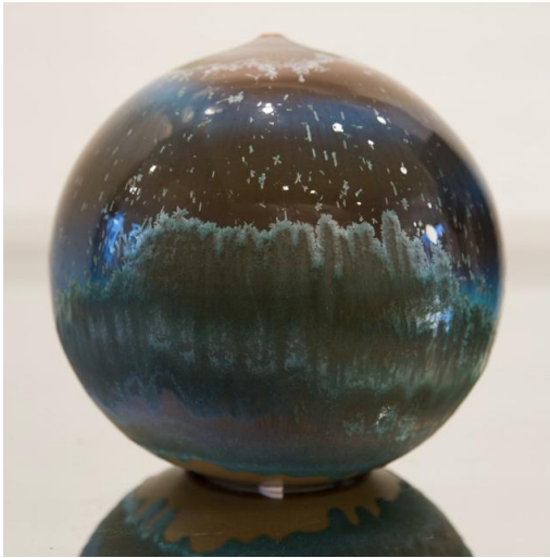
14. Pot bleu: dimensions 22 x 19 cm, 1990 (sold)